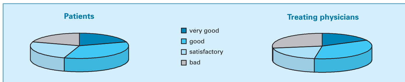
Fig. 2. Assessment of the effectiveness of A. Vogel Hay Fever Spray by patients and treating physicians.